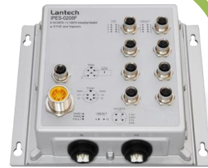
IP 67 Rated