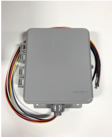
SL-4-AC Outside View

The SL-4-AC enclosure is equipped with a tamper detection system and sends an alarm to the SmartLink system anytime the enclosure has been opened.