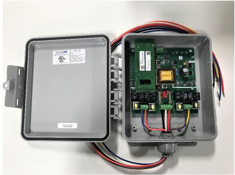
SL-4-AC Inside View