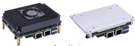
▲ Assembly view