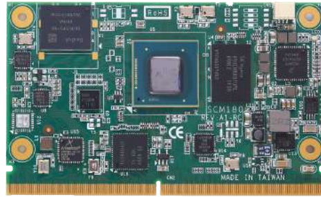
▲ Top View